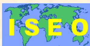
International Sustainable Energy Organisation Geneva, Switzerland