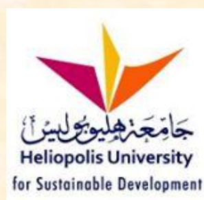
Heliopolis University for Sustainable Development Cairo, Egypt