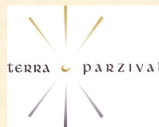
Ustanova Gandin Fundacija / Terra Parzival