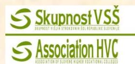
Association of Slovene Higher Vocational Colleges, Slovenia