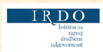
IRDO – Institute for the Development of Social Responsibility Maribor, Slovenia