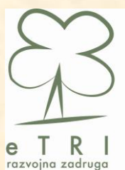
Development Cooperative e TRI, Ecology, Ergonomics and Ethical Economy, Lendava, Slovenia